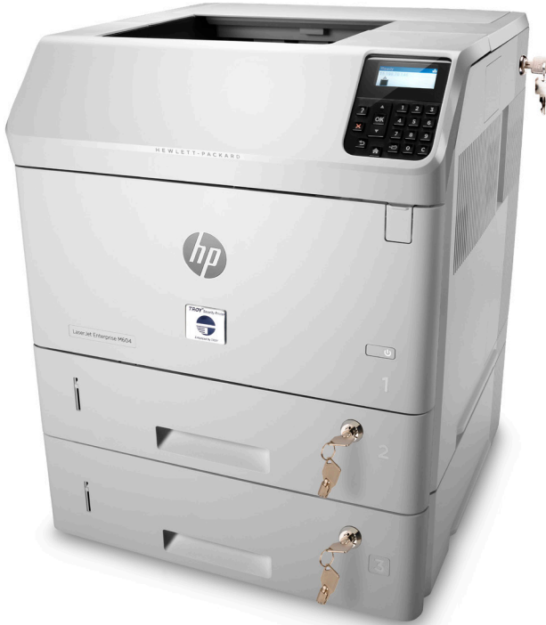
TROY M606 MICR Secure Ex